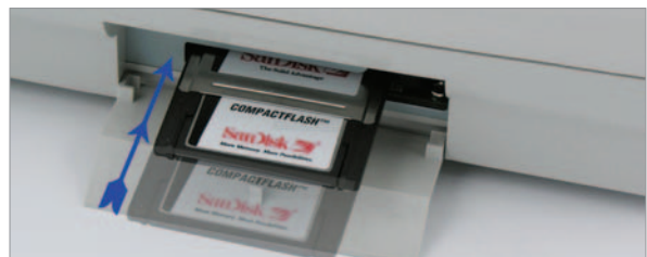
Your dealer can download updates from the Geller website and install them via ML-780s integral flash card slot.

When the EFT/Chip and PIN device accepts the customer's credit card, the ML-780 is authorised to finalise the sale. ML-780 issues a receipt incorporating the value and sale number of the EFT device and the receipt from the EFT device shows the corresponding sale number from the ML-780.