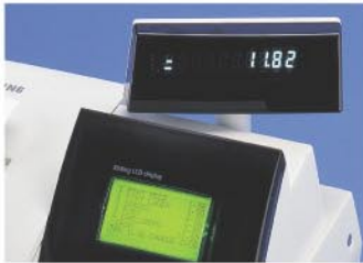
The user can rotate the LCD display for high visibility