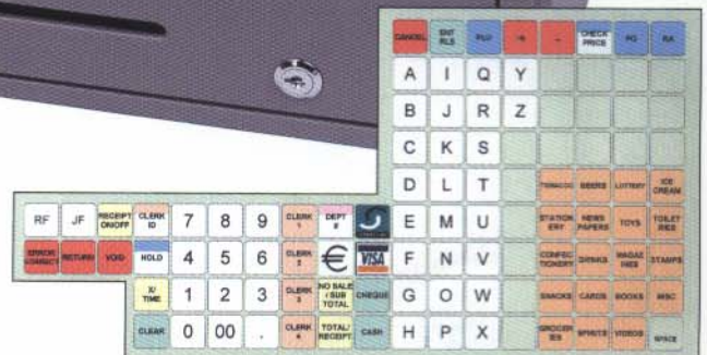
Option of flat keyboard

SMART ECR SYSTEMS THAT DO MORE – COST LESS GELLER ELECTRONIC CASH REGISTER SYSTEMS